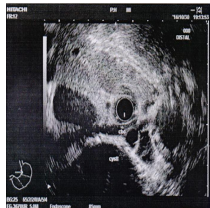
Fig.2: Endoscopic ultrasound shows liver cyst with compression effect in the common bile duct.