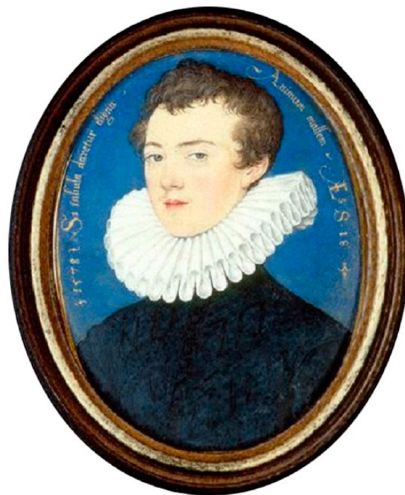
Fig. 1. Sir Francis Bacon (1561–1626) depicted at 18 years of age. The inscription around his head reads “Si tabula daretur digna animo mallet” (“If one could but paint his mind”). Painting by Nicholas Hilliard from the collection of the National Portrait Gallery, London.

superior as Lord Bacon's conception is to earlier notions, a modern reader who is not in awe of his grandiloquence is chiefly struck by the inadequacy of his view of scientific procedure. That we have only to make some crude experiments, to draw