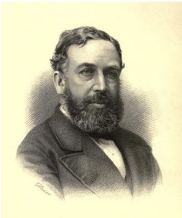
Fig. 3. William Stanley Jevons (1835–1882). Portrait at the age of 42 by G. F. Stodart.

Another stern warning was issued by Jevons (1877/1913; Fig. 3), a highly influential economist and philosopher of science. In his book The Principles of