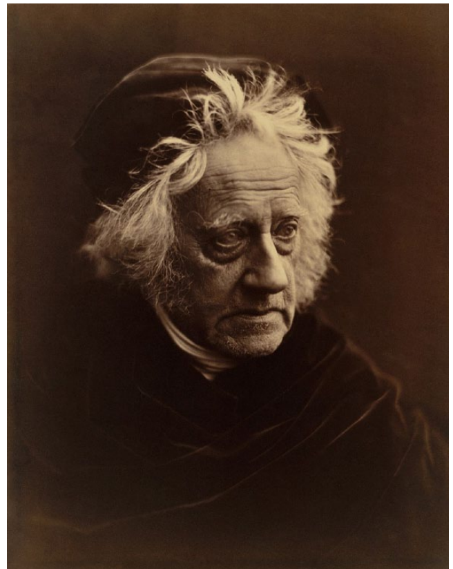
Fig. 2. Sir John Herschel (1792–1871), as photographed in 1867 by Julia Margaret Cameron. Public-domain image available at https://en.wikipedia.org/wiki/John_Herschel#/media/File:Julia_Margaret_Cameron_-_John_Herschel_(Metropolitan_Museum_of_Art_copy,_restored)_cropped.jpg

But before experience itself can be used with advantage, there is one preliminary step to make, which depends wholly on ourselves: it is the absolute dismissal and clearing the mind of all