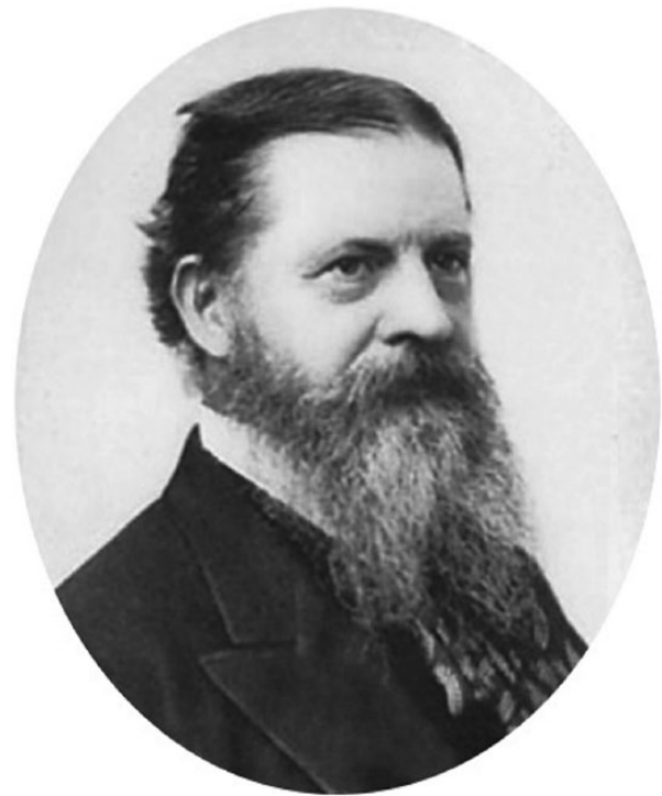
Fig. 5. Charles Sanders Peirce (1839–1914). Public-domain image available at https://en.wikipedia.org/wiki/Charles_Sanders_Peirce#/media/File:Charles_Sanders_Peirce.jpg

C. S. Peirce (pronounced "purse"; 1839–1914; Fig. 5) was a chemist, mathematician, logician, and philosopher of science. Central among Peirce's philosophical interests were questions concerning the scientific