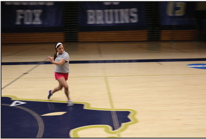
Figure 2. Athlete Demonstrating Carioca Progressing from the West Triangle toward the North Triangle.

A researcher provided verbal instruction as to the next movement and its associated course direction as the athlete neared completion of a task. One trial of the LEFT was performed by each athlete. Time was recorded in seconds using a stopwatch. Test-retest reliability for the LEFT is 0.95 to 0.97. 24