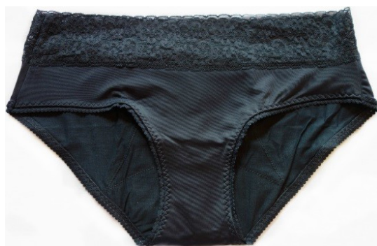
Figure 1 ThinX® brand menstrual underwear, Hiphugger style.

The qualitative sampling strategy was guided by Miles et al 13 recommendations. A minimum of 35 participants