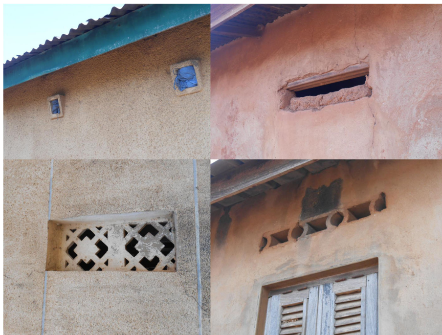
Fig. 3 Examples of ventilation bricks commonly found in the study area in central Côte d'Ivoire. These are often either left un-screened, or blocked (e.g. with LLINs, as shown in the top left image)

The decision was made to use a pyrethroid insecticide for this CRT, despite intense pyrethroid resistance in the study area. The rationale for this decision was two-fold: first, pyrethroids are a relatively safe class of insecticides with low mammalian toxicity and second, of all the candidate actives evaluated in preliminary testing, the beta-cyfluthrin formulation had the highest bioassay mortality for the longest period of time when tested with local, field collected, pyrethroid resistant mosquitoes (Oumbouke, unpublished observations). The efficacy of a pyrethroid against resistant mosquitoes is not surprising, given that the delivery method (i.e. a powder formulation