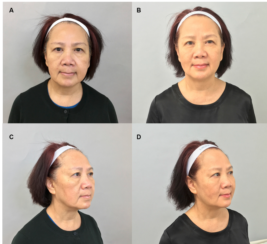
Figure 5 Treatment of the whole-face by RAD hyperdilution.

Notes: Patient is shown before ( A and C ) and 3 months after treatment ( B and D ).