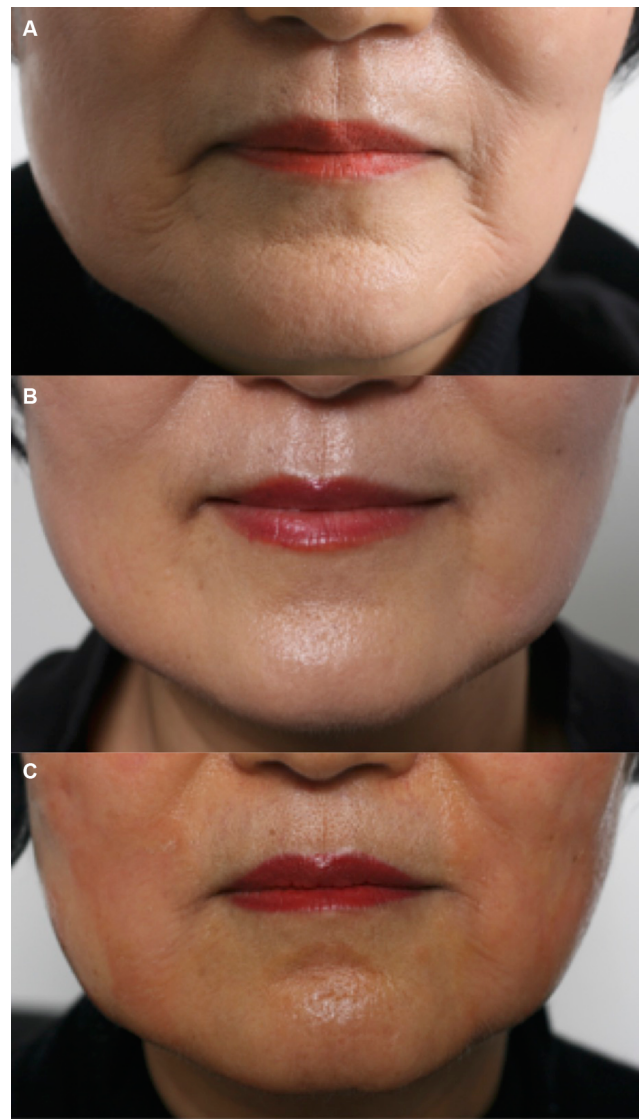
Figure 2 Treatment of marionette lines with diluted RAD using 27G cannula.

A 36-year-old female presented with thin, dry skin, decreased pan-facial skin elasticity anteriorly, and mid-face volume loss with consequent hollowed cheek and relative prominent zygoma and depressive temples (Figure 4A and C). Three milliliters of CaHA was mixed with 2% lidocaine in a 1:1 ratio (total injection volume of 6 cc) and injected with a 27G cannula into the subdermal layer of both cheeks. To treat a wide cheek area, up to 0.01 mL of filler per stroke was injected in a pattern of multiple passes to cover the whole cheek area. Following injection, volume restoration was immediately visible. At 5-months postinjection (Figure 4B and D), the patient's skin showed markedly improved skin tone, elasticity, and brightness (with less pigmentation). Morphological improvements included volume restoration of the hollowed cheek and camouflaging of prominent zygoma