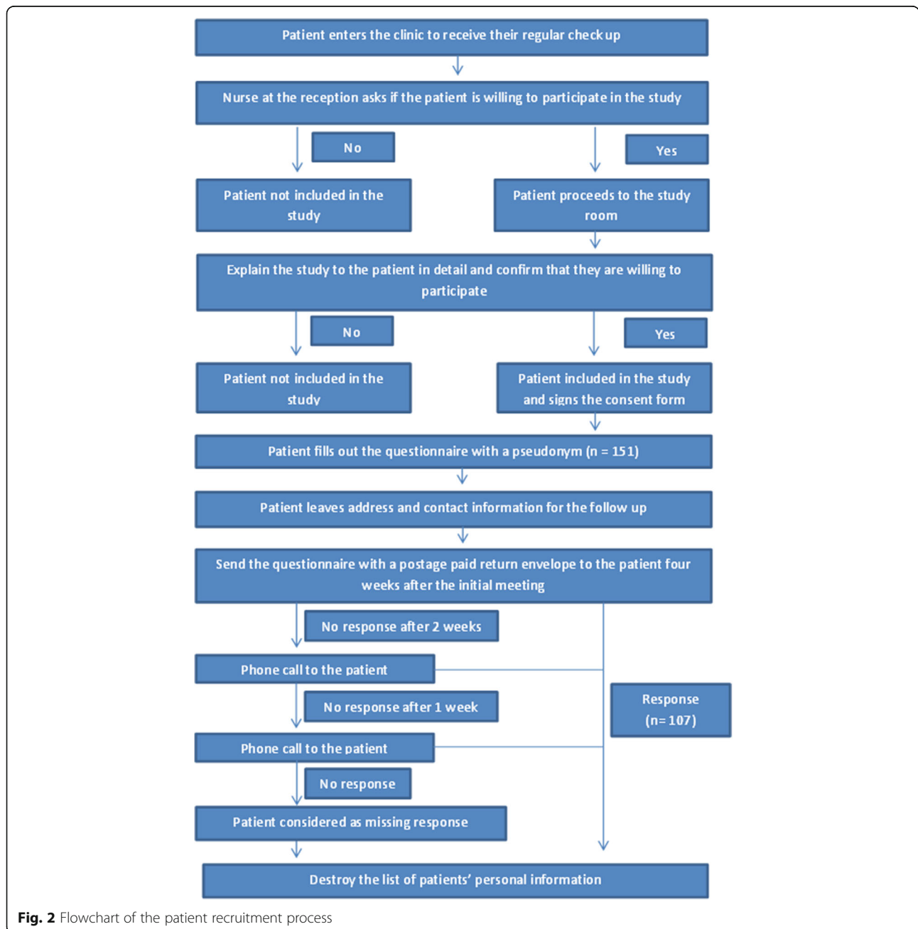
Fig. 2 Flowchart of the patient recruitment process

We computed mean (M), standard deviation (SD), and median (Md) for the descriptive statistics. Answer distribution