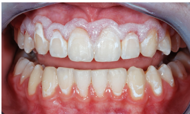
Figure 2 Application of rubber dam to protect soft tissue.

Standardised digital photographs were taken four times: before treatment, 6 months after (figure 4), 1 year after (figure 5) and 4 years after treatment (figure 6). Before taking pictures, the assigned teeth were cleaned using pumice and rubber polishing cups. Clinical examination and photographs showed relevant optical harmonisation of infiltrated WSL with adjacent enamel and aesthetic stability in the time. Colour and lightness characteristics of the Icon infiltrant as well as the aesthetic camouflage effects were not altered significantly or clinically relevant after 4 years. Besides, there was no progression of early carious lesions with arrest of lesions.