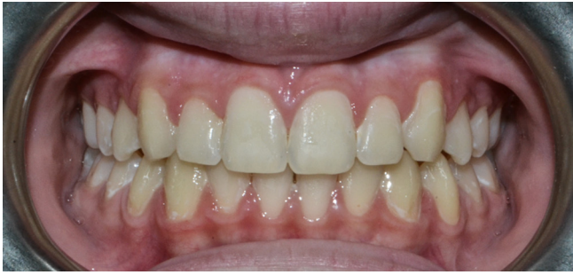
Figure 5 One-year follow-up picture.

may also exhibit aesthetic changes a few years after treatment. Early enamel lesions present an apparent intact layer followed by a subsurface porous area, called the body of the lesion. During demineralisation of the enamel, the pore volume of the WSLs increases, and hence, the RI of the lesions can be altered by light scattering. The microporosities of enamel caries are filled with either a watery medium or air. Due to the difference between the RI of sound enamel (RI: 1,62) and water (RI: 1,33) or air (RI: 1.0) within the body of a lesion, ambient light which shines on the teeth is deflected and scattered, making the initial carious lesions appear as a clinically visible opacity especially when desiccated. 10