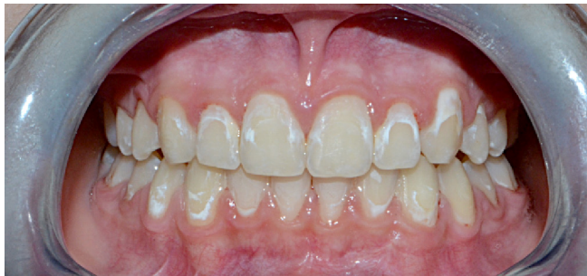
Figure 1 Preoperative picture showing numerous white spot lesions (WSLs) of upper and lower dental arch.

desiccated by applying ethanol (Icon-Dry) for 30s followed by air drying. Dry solution provides a preview of the aesthetic result that could be expected after infiltration. Previous studies on the subject showed that frequency of etching intervals needs to be adjusted to the surface hardness and the depth of the WSLs. 7 In this case, on the basis of the aesthetic outcomes obtained, etching was performed a second time for a further 2min on deeper lesions on teeth 1.2, 2.2, 2.3, 2.4, 3.2, 3.3, 4.3 and 4.4.