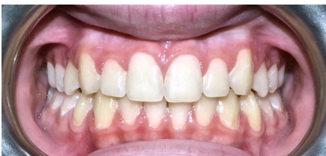
Figure 6 Four-year follow-up picture.

Several short-term studies, in vitro research and case reports have been conducted but case reports with a large number of involved teeth by WSLs and with a 4-year follow-up are not described. The results showed sufficient durability over 4 years and clinical and aesthetic results stable at 3 and 6 months, 1 and 4 years. The resin infiltration technique demonstrated having several advantages: mechanical stabilisation of demineralised enamel, maintenance of sound hard substance, permanent closure of surface micropores, obturation of porous and deeply demineralised areas, inhibition of lesion progression by increasing resistance to demineralisation and high patient