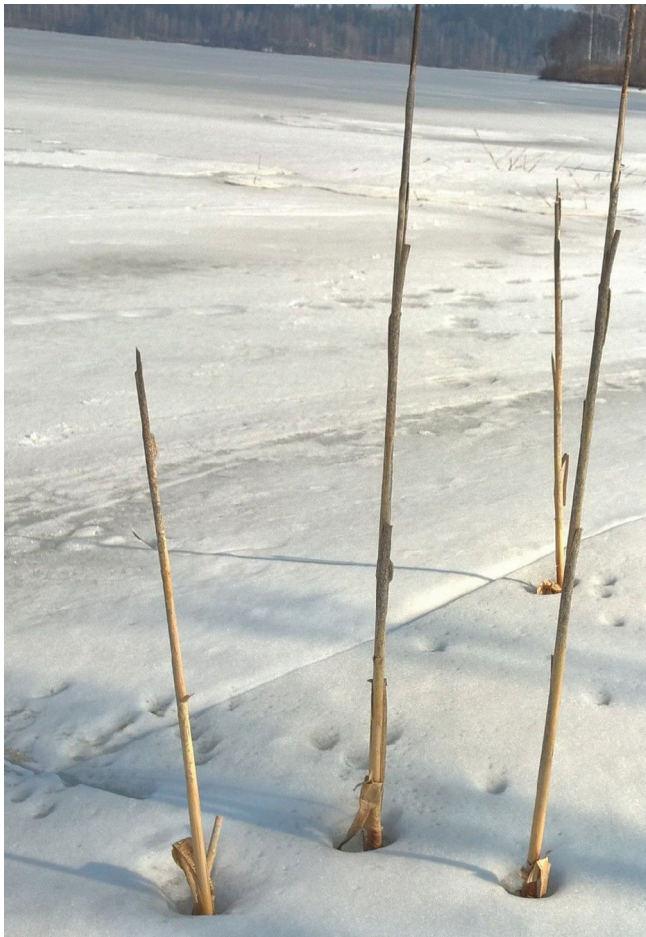
Figure 1 Scene of the accident: the left-most common cattail penetrated deep into the patient's throat (photograph taken 2 months after the accident).

such as cutting firewood with a chainsaw, the neck pain worsened considerably and the pain area swelled for several days. In addition, the patient's grandchildren repeatedly noticed a disagreeable odour emanating from the patient. Eleven months after the accident, MRIs showed a large fluid-filled cavity and a >5 cm long foreign body inside the neck muscles. Retrospectively by careful examination, that foreign body was observable in one slice of the very first unenhanced CT images, but not in subsequent CT images. After a nearly 1-year delay, a large amount of pus and a still-hard, solid piece of the cattail were removed from the neck muscles under general anaesthesia (figure 4). Bacterial and fungal cultures from the pus grew no organisms.