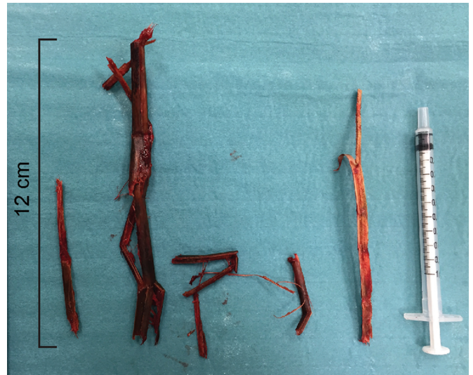
Figure 3 Five pieces of common cattail, removed through the original wound in the soft palate. The right-most piece lacks about a 2 cm bit cut for bacteria culture.