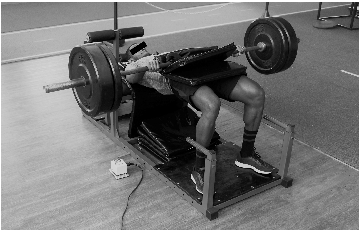
Fig 2. An Olympic sprinter performing a loaded hip-thrust at the optimum power zone.

Although small, the differences between the correlations presented by hip-thrust and vertical jumps in the maximum acceleration phase (i.e., from zero to 10-m) should be highlighted and considered as worthwhile outcomes (Table 3). Indeed, in elite sprinting, trivial variances