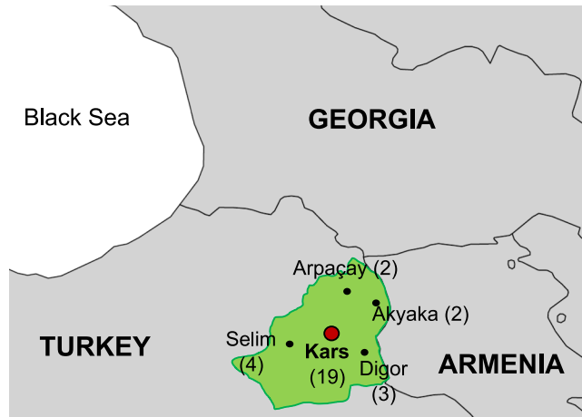
Figure 1. Overview map of the southern Caucasus region. Indicated in green is Kars province with its capital, the city of Kars (red circle). Numbers of strains isolated from diverse Kars province counties (capitals indicated, including Kars city) are given in parenthesis.