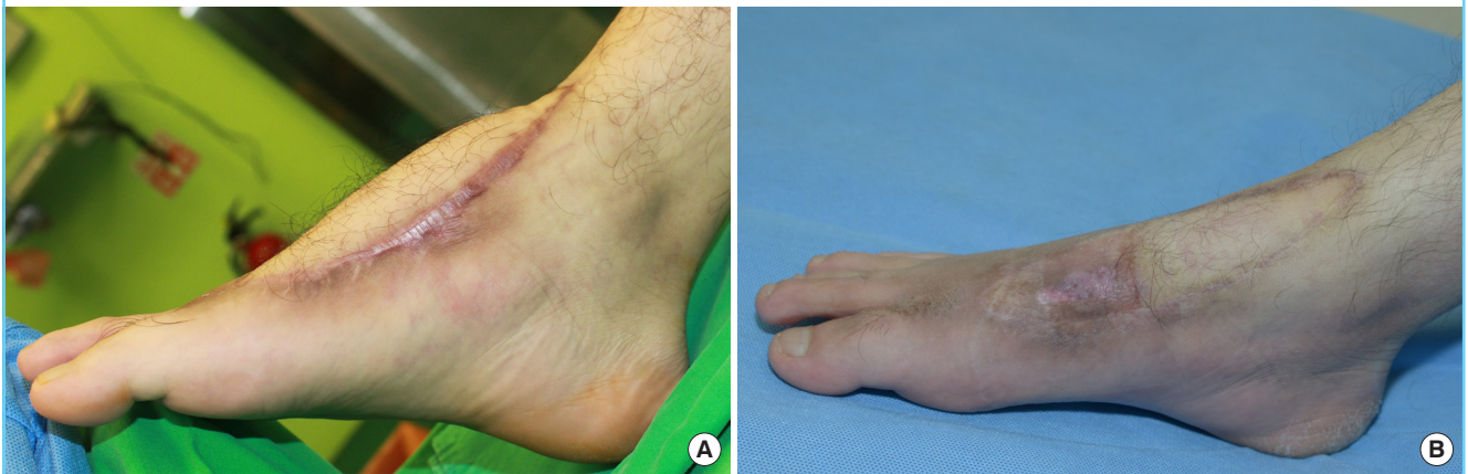
Fig. 4. Flap contouring by ultrasound-assisted liposuction

A patient underwent a superficial circumflex iliac artery perforator (SCIP) free flap operation to cover an open wound on the right foot dorsum caused by a burn. (A) Gross picture taken 6 months after the SCIP free flap operation. The bulky flap limited dorsiflexion and caused discomfort wearing shoes. (B) Gross picture taken 6 months after secondary debulking using power-assisted liposuction. Partial skin necrosis was seen after the debulking procedure, but recovered without an additional procedure.