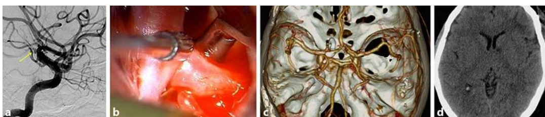
Fig. 3. A 54-year-old woman presented with subarachnoid hemorrhage, a sudden bursting headache, and vomiting. a Cerebral catheter angiography showed a left proximal A1 aneurysm with bilobulation. Using a modified orbitozygomatic approach, the aneurysm was clipped with a 6-mm, 90-degree-angled standard clip. b The clip blade was parallel to the planum sphenoidale and the clip tip was parallel to the left internal carotid artery. c Postoperative computed tomographic angiography showed that the clip tip was parallel to A1 and the clip head was vertical to planum sphenoidale, indicating clip rotation. d Five days after the operation, computed tomography showed a small lacunar infarction at the genu of the left internal capsule.