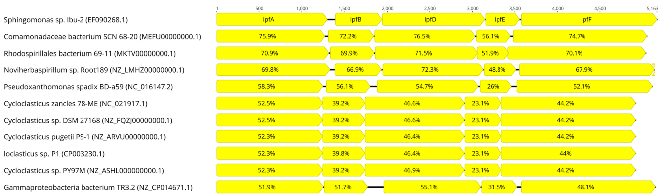
Fig. 4 Comparison of ipfABDEF gene clusters of 11 bacterial strains. Direction of transcription was indicated by arrows. ipfA , large subunit of aromatic ring dioxygenase; ipfB , small subunit of aromatic ring

dioxygenase; ipfD , sterol carrier protein X thiolase; ipfE , function unknown; ipfF , ibuprofen-CoA ligase