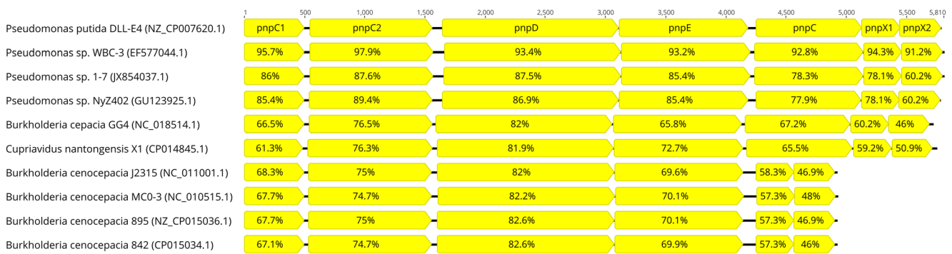
Fig. 2 Comparison of pnpC1C2DECX1X2 gene clusters of ten bacterial strains. Direction of transcription is indicated by arrows. pnpC1 , small subunit of hydroquinone dioxygenase; pnpC2 , large subunit of hydroquinone dioxygenase; pnpD , 4-hydroxyomuconic semi-aldehyde

dehydrogenase; pnpE , maleylacetic acid reductase; pnpC , hydroxyhydroquinone dioxygenase; pnpX1 , YciI family protein; pnpX2 , ferredoxin