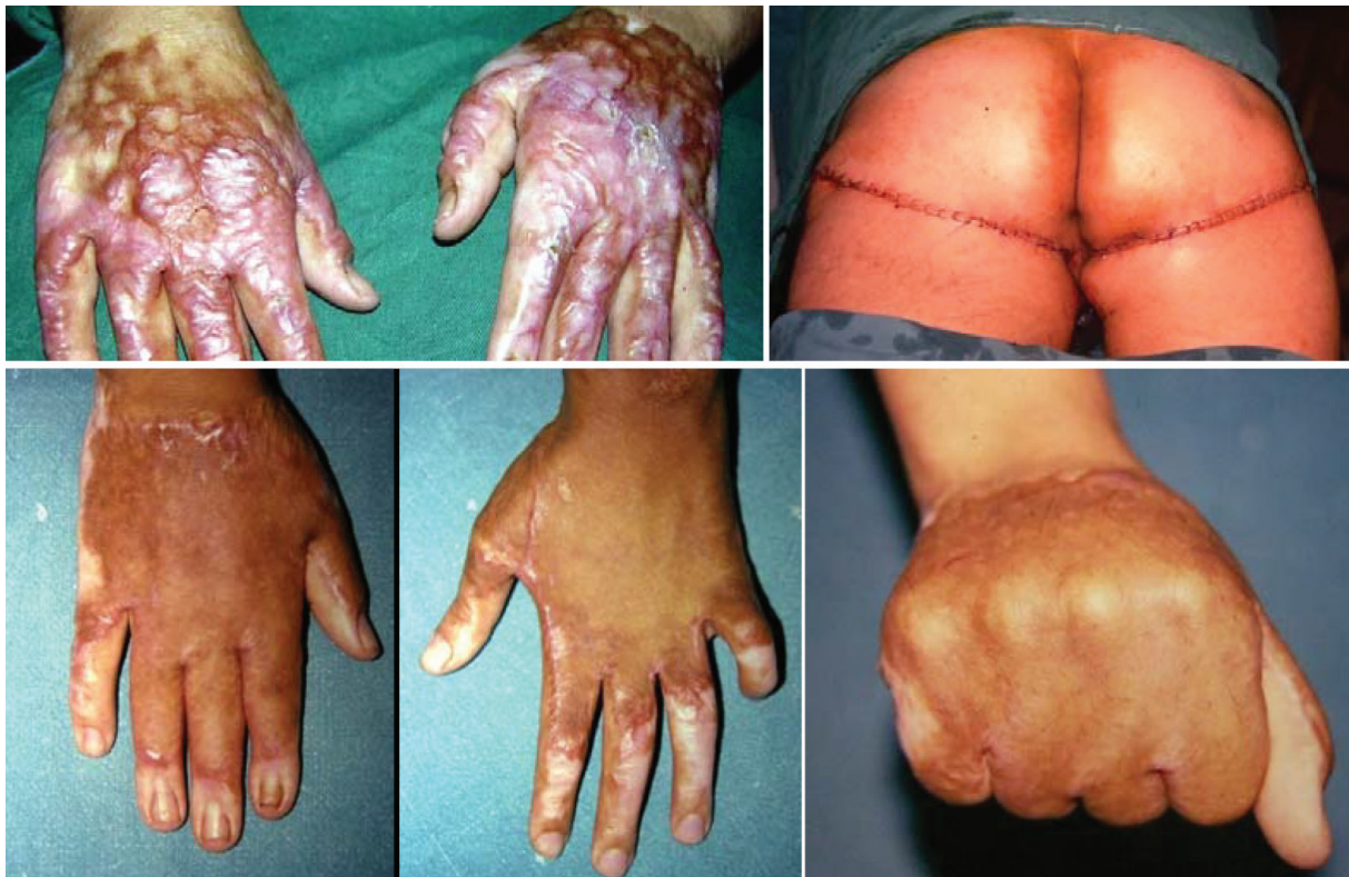
Fig. 1: Case No. 26; 28 years old girl with post burn hypertrophic scarring in both hands. Donor sites were bilateral subgluteal creases of 18x11 cm and 20x12 cm. Graft taken well with full function regain in aesthetically accepted hands.

wound closure exactly at the subgluteal skin crease. We usually cover the subgluteal wound dressing with an isolating polyurethane adhesive transparent film, to isolate it from perineal area as much as possible till complete healing.