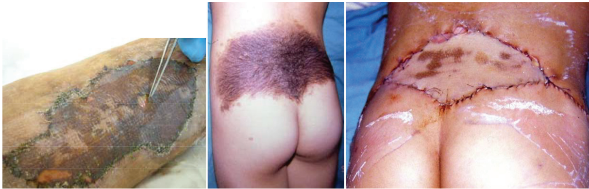
Fig. 3: Examples of complications. Left: superficial skin peeling, Right: small patches of graft loss complicating subcutaneous collection, it was coverage of the defect (19×8 cm) resulting from excision of giant hairy mole of the middle photo (case no. 1).

share the opinion of many authors regarding the precautions on graft harvesting, application and fixation. 2-4 We share the consensus of superiority of full-thickness over split-thickness skin graft, as they undergo minimal secondary contracture and maintain their robustness in less likelihood of graft trauma with more uniform texture. 9-12