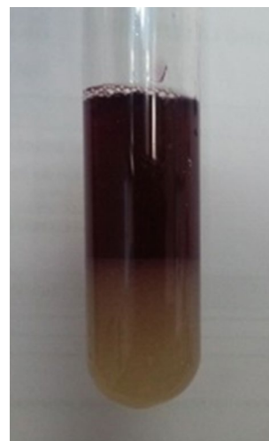
Fig. 1 Positive Watson and Schwartz test of the patient; the upper layer is red because porphobilinogen-Ehrlich complex extracts into the upper, aqueous layer

Since heme arginate is not available in Sri Lanka the patient was managed only symptomatically. Carbohydrate loading with intravenous dextrose and oral carbohydrates was the only feasible option. All the medications used for symptomatic management were checked for safety in acute porphyrias. Patient was discharged from the ward after symptoms gradually improved over 6 days to a degree that he can be managed as an out-patient. Response to treatment could