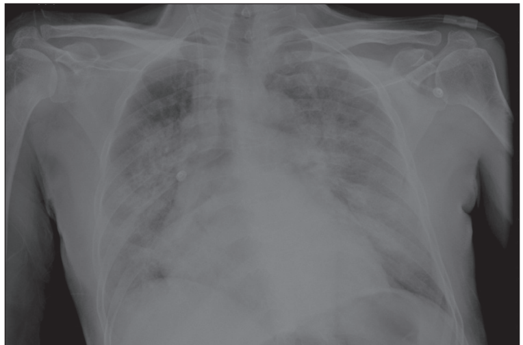
Figure 1. Chest X-ray on the third day of admission. Accentuated bronchovascular lung markings and multiple patchy opacities present in both lungs.

Acute myocarditis can be confidently diagnosed using CMR. 5-8 The signal response from normal myocardi-