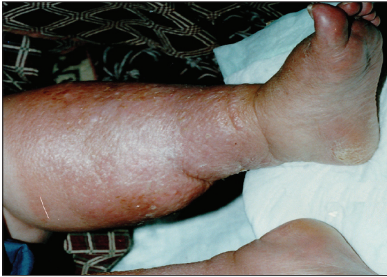
Figure 4. Lesions healed at end of the fourth month, after therapy with itraconazole.

itraconazole therapy the lesions on both legs completely disappeared. After this period itraconazole was given in gradually decreasing doses four months more, reducing the dose 100 mg/day from the previous month (Figure 4). There was no recurrence of the lesions 3 years after the completion of itraconazole therapy.