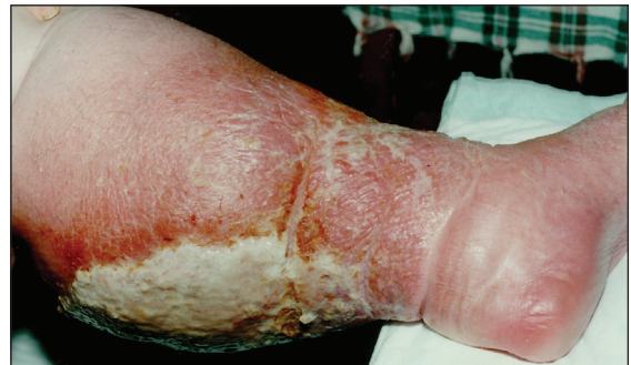
Figure 1. Pustular lesions on the back of leg, before treatment.

The physical examination of the patient showed that she could not walk because of obesity and gonarthrosis and she was confined to a wheelchair. On