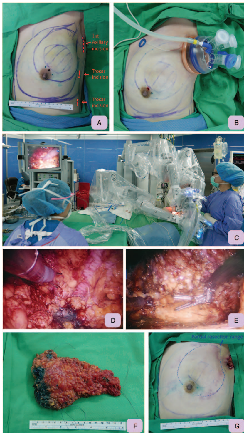
Figure 2. Demonstration of technique tips for RAQ. A, Pre-operative and intra-operative sonography was used to mark the location of the tumor and resection margin. Axillary incision and two additional trocar sites for RAQ and robotic latissimus dorsi flap harvest were marked with red dotted lines and arrows. B, After creation of the working space, a single port (Glove Port, Nelis, Gyeonggi-do, Korea) was inserted over the operating axilla. It was then inflated with carbon dioxide with air pressure kept at 8mm Hg to create space for partial mastectomy. C, Picture shows the setting of RAQ, which was performed with a da Vinci Si (Intuitive Surgical, Sunnyvale, CA) robotic platform with the operating surgeon controlling at the console. D, Anterior skin flap dissecting was performed by dissection between skin flaps and breast glandular tissue with monopolar scissors. The parenchyma resection was performed with monopolar scissors along the inked resection margin, which was created by methylene blue containing jelly. E, After peripheral dissection and parenchyma resection, the left upper outer quadrantectomy was completed. F, The entire resected quadrantectomy breast specimen, which was intact and marked with silk threads for pathologic orientation, was removed through the axillary wound. G, Immediately post RAQ, the wound was small and hidden in the axilla region. However, a defect over the left upper outer quadrant was obvious due to a large portion of breast being removed. RAQ = robotic assisted quadrantectomy.