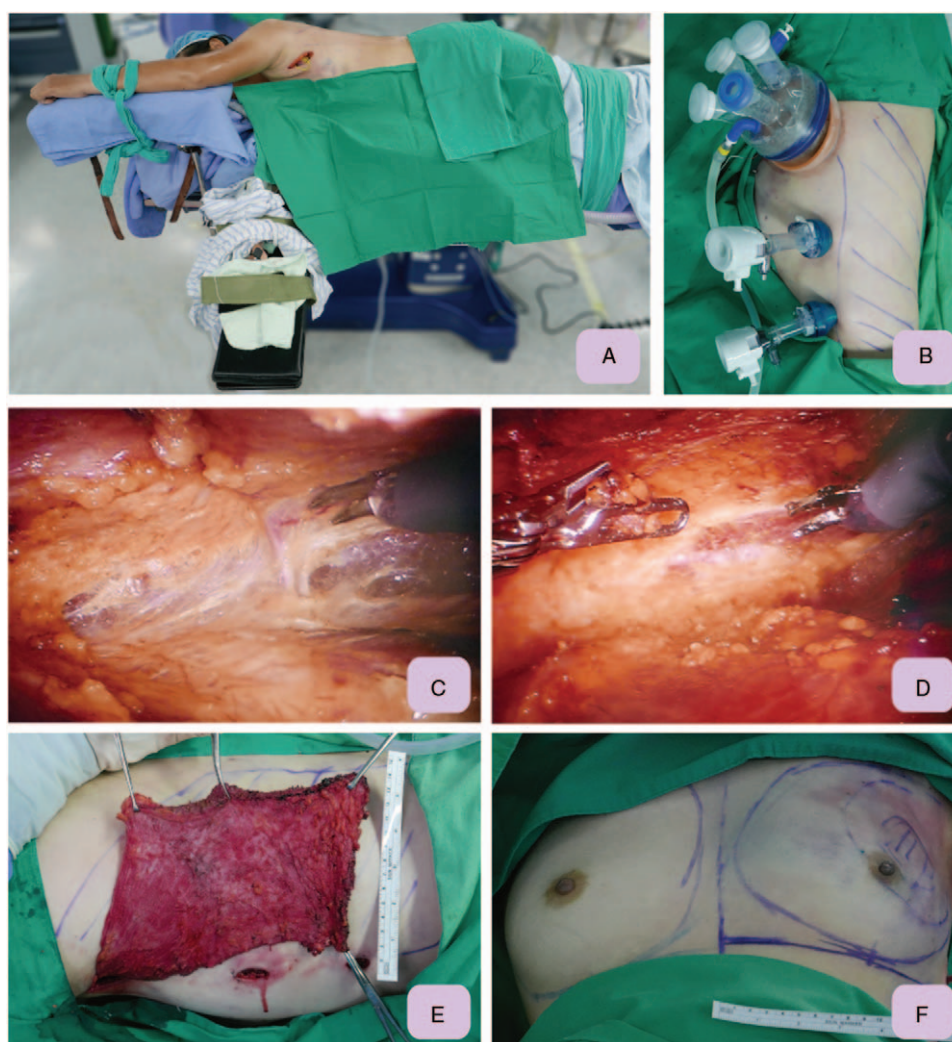
Figure 3. Demonstration of technique tips of IPBR with RLDFH. A, From the axillary wound, the thoracodorsal pedicle was identified and marked with a vessel loop. Then the wound was packed, and the patient was shifted to decubitus position. B, Two 12 mm balloon trocars (Kii Balloon blunt tip system, Applied Medical, Rancho Santa Margarita, CA) were used as port site for monopolar scissor and prograsp forceps. After all the 3 ports were set, the video camera was shifted to the middle port, and the monopolar scissors were shifted to the inferior opening of the axillary accessory port. C, Dissection was suggested to begin along the undersurface of the muscle. After the undersurface of the muscle is dissected to the borders, the prograsp forceps is used to direct the anterior edge of the muscle toward the chest wall, and dissection proceeds over the superficial surface of the muscle. D, Once dissection is complete along both the deep and superficial surfaces, monopolar scissors are used to disinsert the muscle from the inferoposterior border. As the muscle is released, it is gathered toward the axilla to maintain tension and visualization along the posterior border. E, The pedicled latissimus dorsi flap, which was harvested by robotic means, was ready for transfer to post mastectomy subcutaneous space. The wound was small over the axilla, and 2 1 cm trocar wounds could be used as drain exit sites. F, Front view of immediate post-breast reconstruction outcome. The flap was fixed internally in the resected defect to ensure full coverage of the post partial mastectomy defect. IPBR = immediate partial breast reconstruction, RLDFH = robotic latissimus dorsi flap harvest.

In small-to-medium-breast-size breast women with breast cancer who desire breast conservation, VR with autologous flap is in some circumstances a rational alternative to mastectomy. [6] The LDF is one of the most reliable flaps for VR and is often indicated when the resected volume is greater than 150 gm. [6] In this case report, the resected breast weight was 203 gm, which from our estimation was approximately 45% of the breast's volume. That led us to suggest that the patient receive VR with autologous LDF for partial breast reconstruction. The post-operative cosmetic result (Fig. 4) was quite good, and the patient was satisfied with the breast shape and wound result. The most frequent encountered complications of conventional LDF harvest were seroma formation, and wound related complications, like