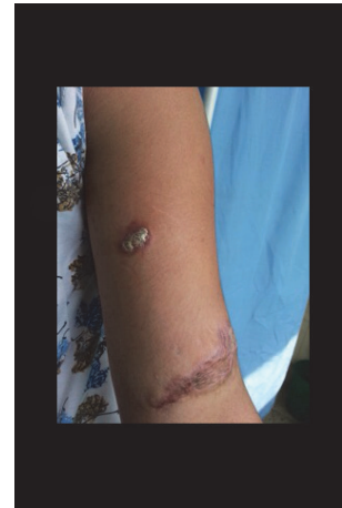
FIGURE 1: Erythematous plaque (2 * 1 cm) of lupus vulgaris on right forearm of a 17-year-old female with a history of trauma forming a linear scar (4 * 2 cm), visiting TUTH.

9.3. Erythema Induratum of Bazin. Erythema induratum of Bazin is a granulomatous lobular panniculitis, which appears as erythematous-purplish subcutaneous nodules usually in legs and thighs [26]. The nodules advance few centimeters in diameter forming deep ulcers with caseous discharges and leave pigmented scar without or after successful treatment.