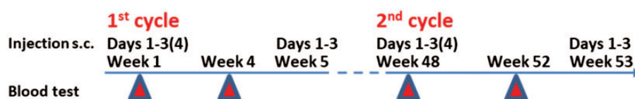
Figure 1. Dosing of subcutaneous (s.c.) cladribine according to individual total lymphocyte count.

Even in affluent healthcare settings, cost-effectiveness considerations often restrict access to DMT. 3,13 This applies, for example, to pwMS with higher levels of disability, or with less than two documented relapses over the past two years. 3 Based on its favourable risk/benefit profile, we have used subcutaneous cladribine in a number of pwMS who in our healthcare setting, the UK National Health Service, were not eligible for a licensed DMT. 3 In developing our treatment schedule (Figure 1), we took into account both the bio-availability of injectable (100%) versus oral (42%) cladribine, and concerns raised by the European Medicines Agency in their negative assessment in 2010–2011 of oral cladribine. 19,33 Firstly, we undertook a meta-analysis of phase III trial data, comparing the incidence of cancer among all DMTs licensed by 2015 with the pivotal trial of oral cladribine and detected no risk difference among all DMTs. 29 Secondly, to avoid lymphopenia grades 3 and 4, we decided to adapt the dose administered to individual lymphocyte count. The safety of this agent was subsequently further supported by the licensing of oral cladribine prodrug following re-assessment of safety data in 2017. 34 Since 2014, we have treated over 150 pwMS using