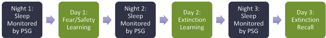
Fig. 1. Timeline of testing phase.

PTSD scale (CAPS) to establish current PTSD diagnosis and individual modules from the Structured Clinical Interview for DSM-IV (SCID-IV) to rule out exclusionary psychiatric diagnoses (see Measures below). Informed consent was signed at the beginning of this first in-person meeting. Participants also underwent a Startle Threshold Testing session, which consisted of presentation of 16 acoustic startle probes (in the absence of any visual cue) to examine baseline startle reactivity. Veterans who did not meet the criterion of responding to at least 75% (12 of 16) of the startle probes were deemed nonresponders and excluded from participation in the study. Those not excluded based on these measures underwent one week of baseline sleep assessment at home, during which they filled out Sleep Diaries and wore a wrist actigraph to characterize baseline sleep.