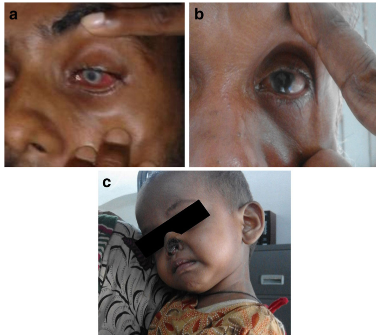
Fig. 3 a Unexpected serious adverse event: Anular corneal ulcer. b Unexpected serious adverse event: Morren's ulcer. c Unexpected serious adverse event: Avascular necrosis of the nasal alae

for conducting pharmacovigilance activities. This is reflected in the number of treatment centers reporting cases, which increased from 38% (10) to 100% (26) after the third refresher training. Therefore, the program should consider conducting periodic training of pharmacovigilance teams at the UHC to keep pharmacovigilance reporting functional. As focused pharmacovigilance has proven to be successful in the Bangladeshi context, similar initiatives may be taken up by other member countries conducting VL elimination programs, as well as other countries where leishmaniasis is prevalent.