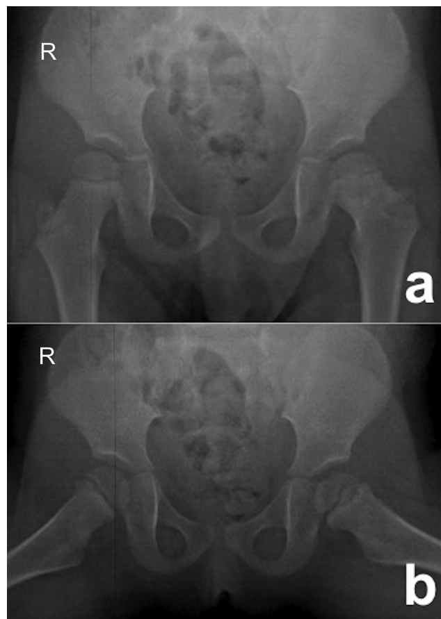
Fig. 3 Anteroposterior (a) and frog-leg (b) pelvic radiographs of a three-year-old female patient who had been treated by Pavlik's method due to Graf type IIb hip on the left side at four months of age. This revealed osteonecrosis of the femoral head (ON) involving the ossific nucleus and central physis. Although the hip became normal (Graf type I) following eight weeks treatment, ON could not be prevented.

The rate of ON related to Pavlik's method shows a wide range from 1% to 30% in the literature 8 (Fig. 3). The correlation between the severity of hip dysplasia and development of ON was assessed in several publications. The risk of development of ON was found to be higher in sonographical Graf type IV 35,46,48 or radiographically dislocated hips. 31 On the other hand, a correlation between the type of hip pathology and the development of ON was not confirmed in another study. 45 Initiation of the treatment over three months of age, 49 non-visible ossific nucleus at the time of treatment initiation, 40 prolonged duration of treatment 49 and accompanying significant adductor muscle contracture 30 were the other reported variables related to an increased risk of development of ON. The rate of ON