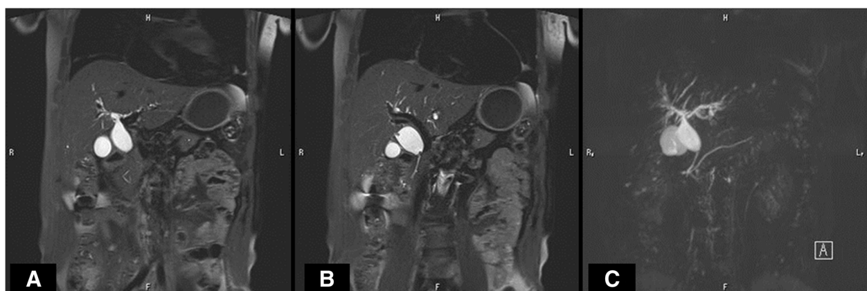
Fig. 1 Magnetic resonance cholangiopancreatography (MRCP). MRCP revealed a dilatation from the common hepatic duct to the middle bile duct (a and b) with pancreaticobiliary maljunction (c)

Although the recommended treatment for a biliary dilatation with the “complex type” classification of PBM is an extrahepatic bile duct resection and hepaticojejunostomy (biliary diversion procedure), [3] selecting the transection lines of the CBD is occasionally difficult. It is important to leave as little as possible of the bile duct unresected, and in this case, the bile duct on the pancreatic side was transected at the bifurcation of the common channel and ventral pancreatic duct so as not to leave the bile duct because drainage from the ventral pancreatic duct to the dorsal pancreatic duct can be identified by ERCP. The patient is doing well without