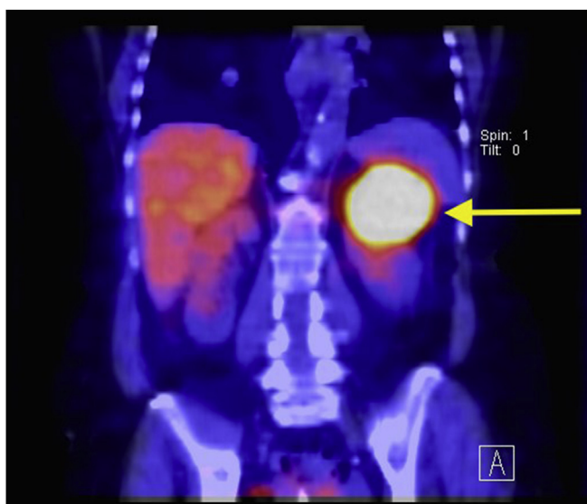
Fig. 2. 233\text{Mbc }^{123}\text{I-MIBG} SPECT CT coronal section of the abdomen scanned at 4 hours post MIBG injection illustrating high MIBG avidity of the left upper kidney lesion measuring 74 \times 59 \times 49 mm (indicated by the yellow arrow). This lesion corresponds the lesion identified on CT scan and confirms a renal paraganglioma. (For interpretation of the references to colour in this figure legend, the reader is referred to the Web version of this article.)

paragangliomas are more likely to be malignant (40%) than pheochromocytomas (10%). 3 Malignant paragangliomas are characterised by the presence of distant sites of metastasis. 3 Sympathetic paragangliomas of the kidney are extremely rare and the mechanism by which they develop in the kidney is unknown. 4 They may occur in the hilum (32%), upper pole (26%) or lower pole (42%) of the kidney. 5