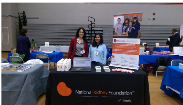
Fig. 5. Shows a photo of two research team members (EJG, NR) at the NKFI-sponsored, Infórmate booth at the Semanas LatinoAmericanas de Salud health fair, 10-3-15.

Wave 2 entailed: (a) radio PSAs ( n = 125 ) across two stations over five weeks; (b) interior train advertisements with 260 cards inside three different CTA L train lines for a four-week period; (c) publishing an advertisement once each in five different local DNAinfo neighborhood newspapers, combined with one month of online advertisements on DNAinfo.com and in DNAinfo e-mail newsletters; (d) Google AdWords keyword search terms; and (e) community outreach. There was no paid social media advertising (e.g., Facebook or Twitter).