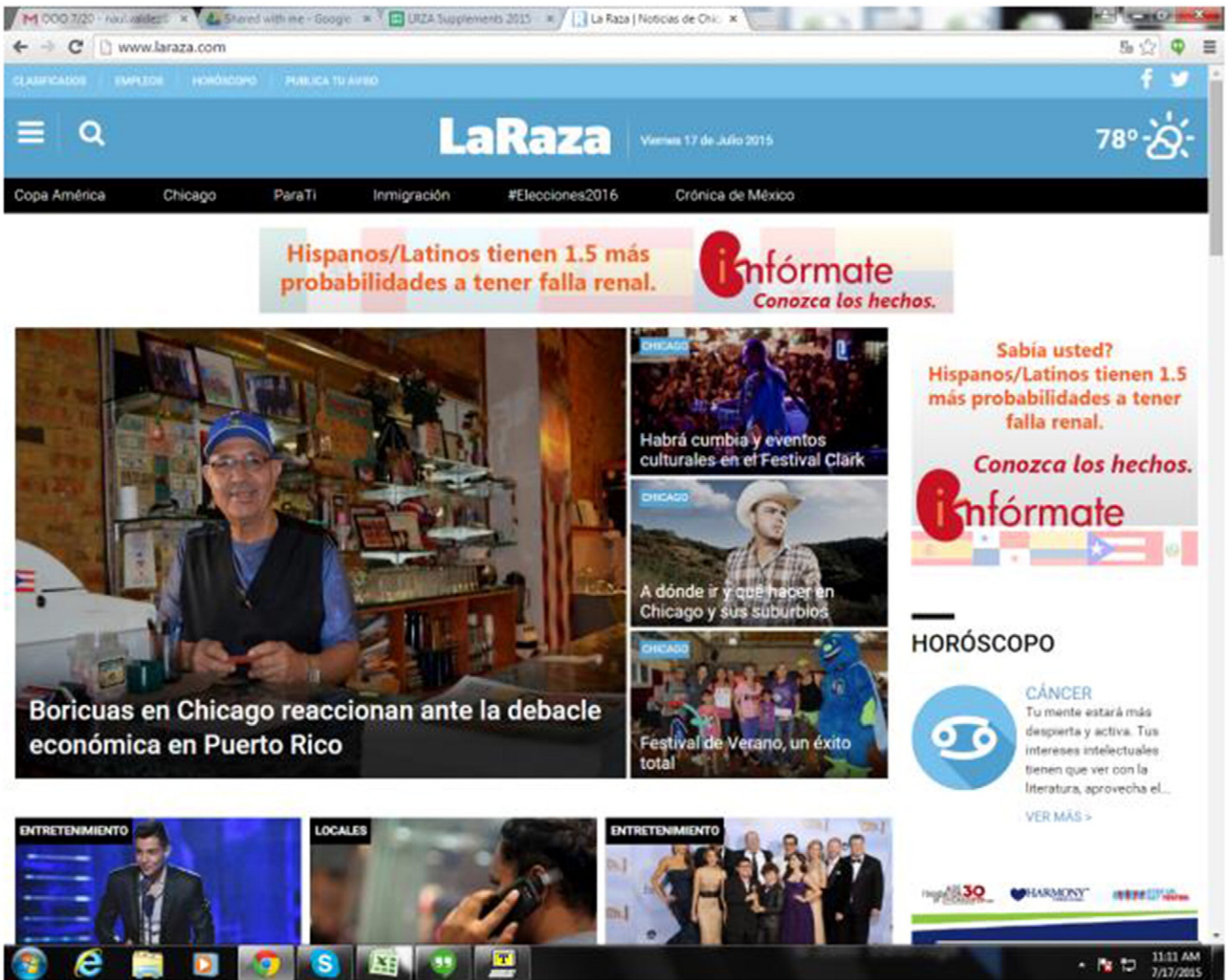
Fig. 3. Provides the Spanish text of our online newsletter advertisement on laraza.com.