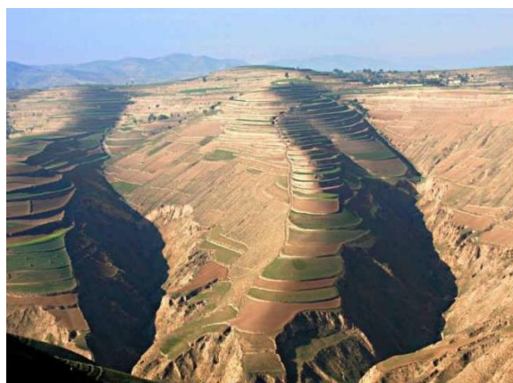
Figure 2. The photo of the typical topography and landform in the Loess Plateau region (China).