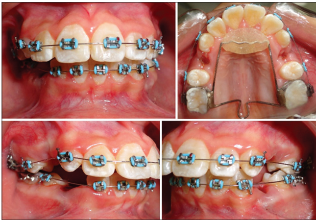
Figure 3: During treatment