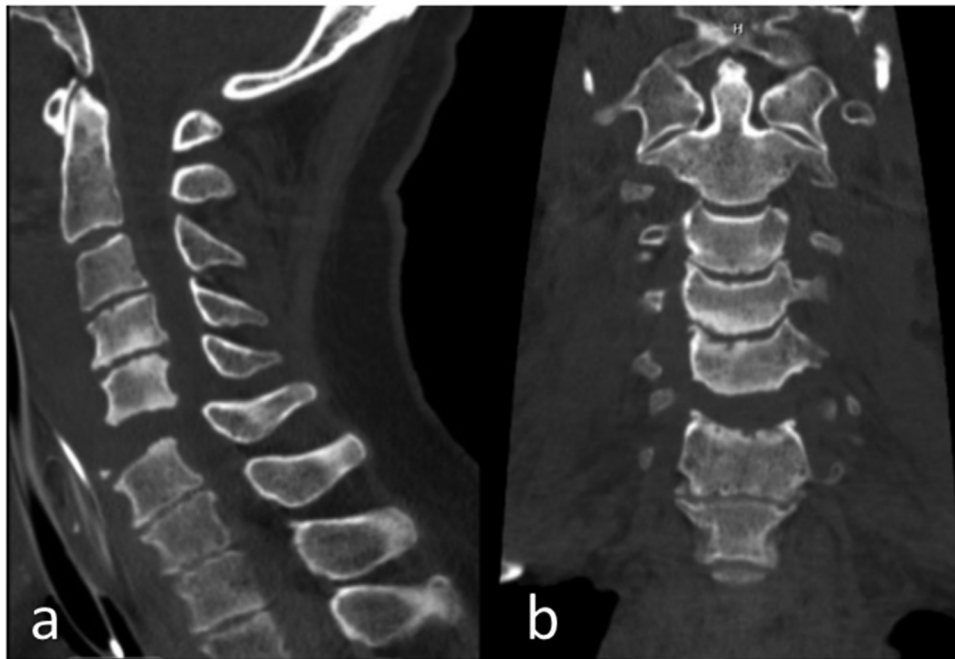
Fig. 2. CT cervical spine without contrast, sagittal (a) and coronal (b) views. Avulsion fracture off the anterior, inferior endplate of C5 with disc space widening, consistent with anterior longitudinal ligament injury. Significant retropharyngeal soft tissue swelling.

not solely attributable to the vessel injury itself, but also to the severe coexisting and distraction injuries. In another recent case of fatal BVI transection with associated intraspinal hematoma, Shibani and Meyer discussed the dilemma faced in managing these injuries among patients with additional life-threatening injuries [6]. Ultimately, they concluded that their ideal management approach would entail immediate endovascular treatment followed by limited surgery addressing cervical instability, prior to spinal decompression surgery or any other repair.