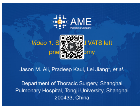
Figure 3 Subxiphoid VATS left pneumonectomy (22). VATS, video-assisted thoracic surgery.

Available online: http://www.asvide.com/article/view/26149