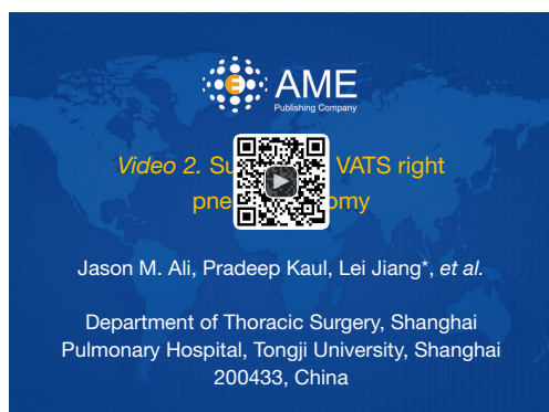
Figure 5 Subxiphoid VATS right pneumonectomy (23). VATS, video-assisted thoracic surgery.

Available online: http://www.asvide.com/article/view/26150