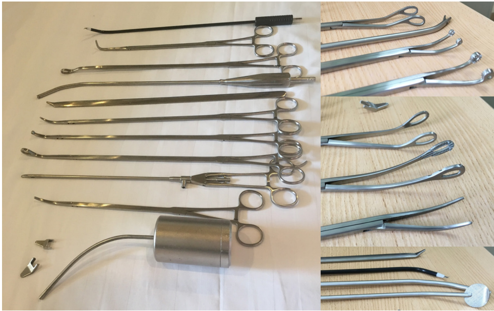
Figure 1 Instruments used for subxiphoid surgery (Shanghai Medical Instruments Group Ltd, Shanghai, China).