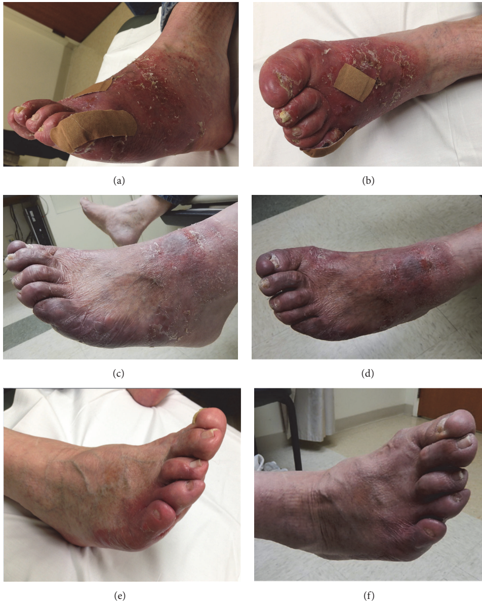
FIGURE 1: (a) and (b) Left foot at presentation. (c) and (d) Left foot at follow-up 11 months later with a new 3-4 cm circular lesion that developed just proximal to the irradiated area. (e) Right foot at presentation. (f) Right foot at follow-up 11 months later.

patient was recommended 8 Gy in 2 fractions of superficial HDR brachytherapy to the entire affected area of his left foot using the Freiburg Flap (FF) applicator (Elekta AB, Stockholm, Sweden) followed by 20 Gy in 10 fractions of 6 MeV external beam electron treatments to the bulky dorsal lesions.