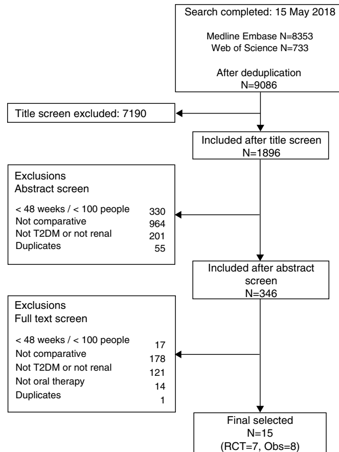
Figure 1. Flow diagram of study selection. Ovid was used to search the Embase and Medline databases.

made we did not complete a meta-analysis of the results, instead we provide a narrative summary of studies. Selected studies and their findings are summarised in Table 1 and Table 2 .