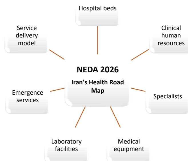
Fig. 1. Iran's National Health Roadmap Components

and economically viable expansion of hospital beds is the first step in the decision-making process to expand other expensive resources of the health system (5).