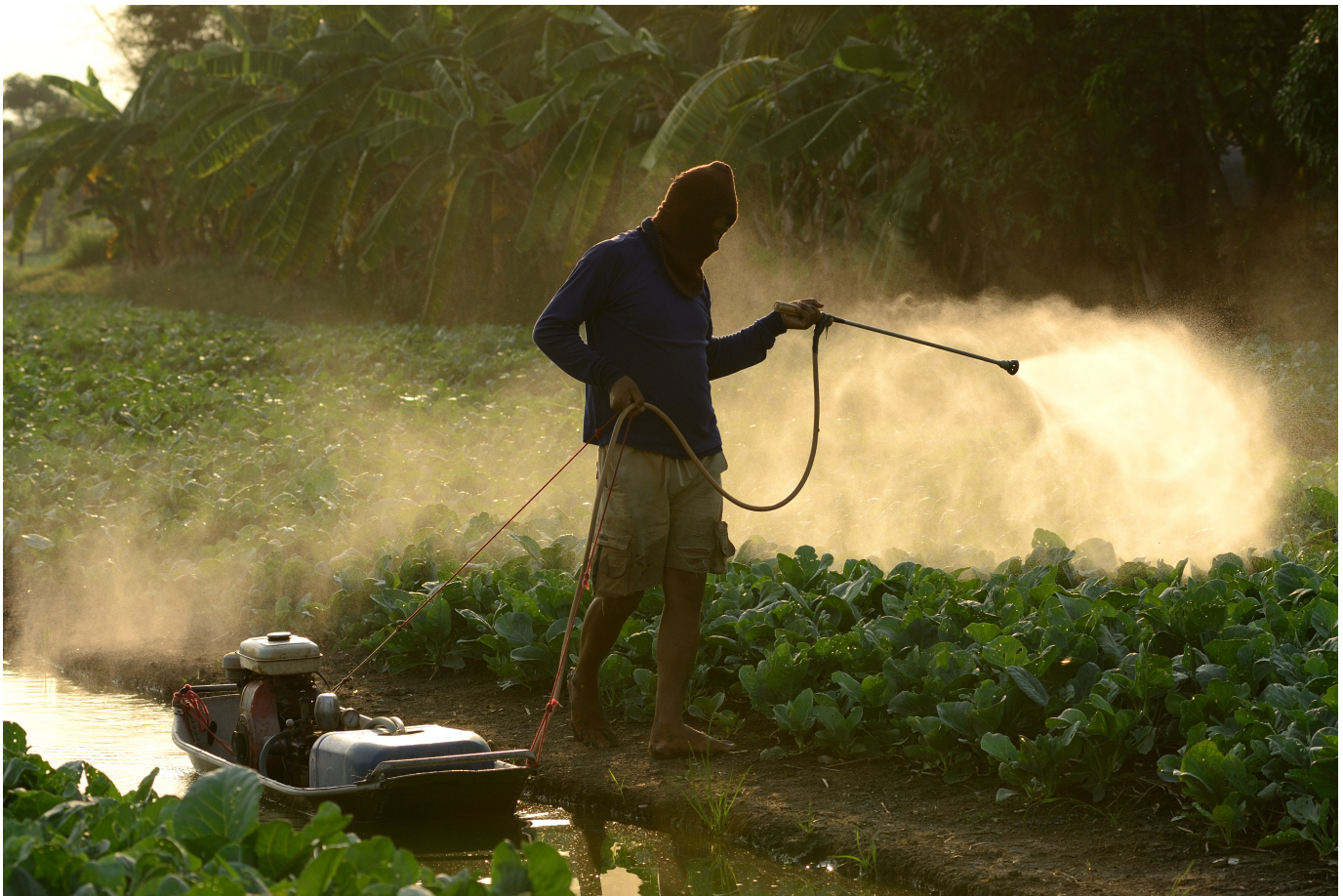
Laboratory research has shown that several environmental chemicals can change the composition and functional capacity of the gut microbiome. For example, studies in mice showed that diazinon, an organophosphate pesticide, altered the animals’ microbiomes in sex-specific ways, with males affected more negatively than females. The implications for humans are unknown.

Matt Rand, a toxicologist at the University of Rochester Medical Center, says gut microbes also may play a role in how quickly the