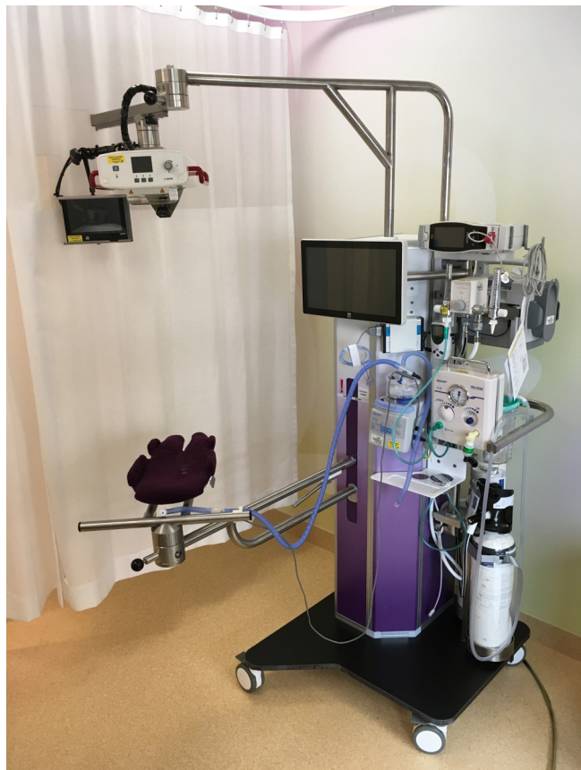
Figure 1 Specially designed new resuscitation table, including the platform for the infant, which can be turned above the mother's pelvis. The table is fully equipped to provide complete standard care and has a respiratory function monitor built in.

numerous practical issues, as well as potential pitfalls, need to be addressed before implementation of PBCC is possible.