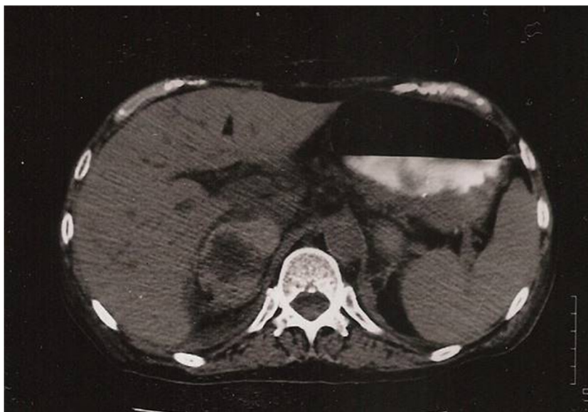
Fig. 1. Abdominal CT scan of case1 demonstrating a mixed attenuation mass in both adrenal glands. There is some preservation of normal adrenal enhancement in the periphery.

mal and no clotting abnormalities were identified preoperatively (Fig. 1).