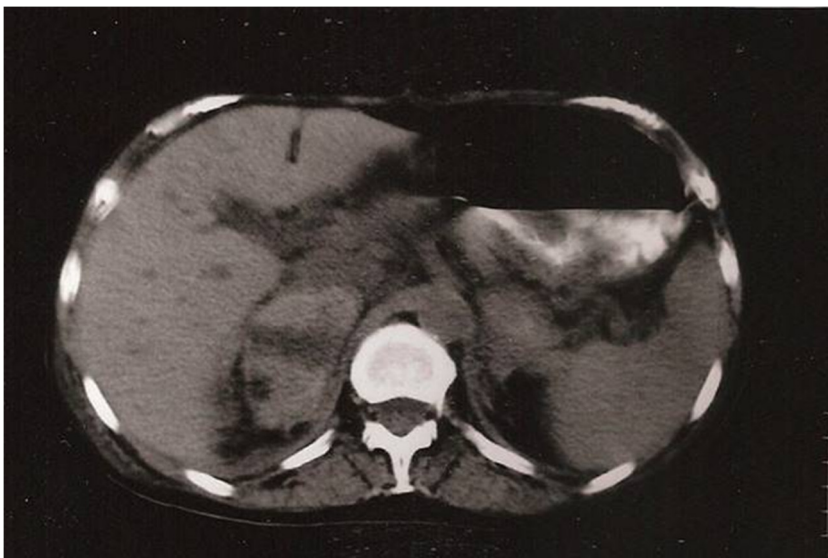
Fig. 2. CT scan of patient in case 2 demonstrating evidence of recent haemorrhage.