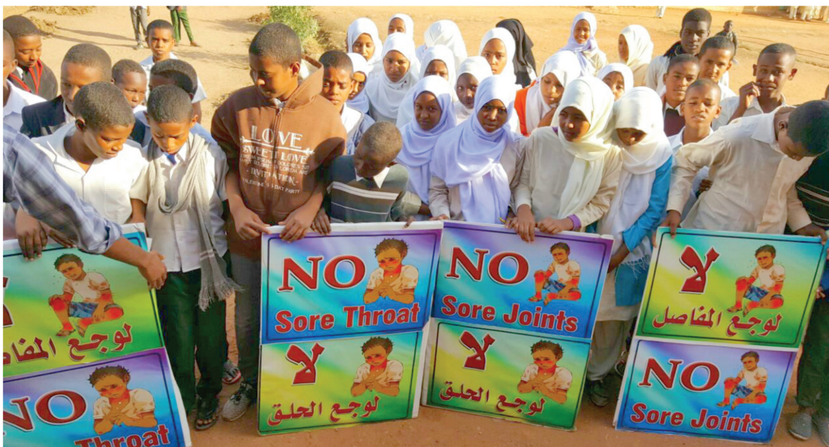
Photo 3 - School children in Al Managil-Gazira State, holding posters showing RHD awareness messages.

Then, North Kordofan Ministry of Health funded the second project (4,000 USD) that was conducted in 13 villages (Photo 2) and showed a strikingly high prevalence of RHD (61/1,000) in the region [4]. Subsequently, Kordofan