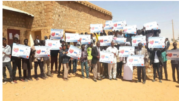
Photo 2 - School children and teachers with officials of North Kordofan Ministry of Health holding posters showing RHD awareness messages: “Painful Joints Destroy the Heart.”

Due to the lack of funding, we opted to submit research proposals in order to study the disease epidemiology and at the same time initiate training of health workers and public awareness campaigns: a policy that we like to call “a research for life” policy. We got the first ever funding of these projects from the Sudan Ministry of Higher