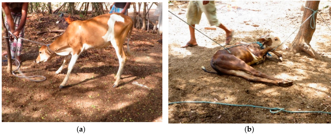
Figure 1. In preparation for branding, animals were roped around the neck (a) and laid on the ground (b).

brands took at least 1 min to apply, substantially longer than the 1–5 s reported for stamp brands in horses and cattle [7,14,15].