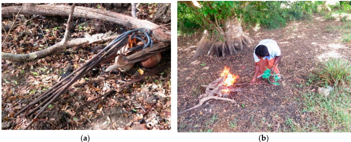
Figure 2. Fire-heated irons used for branding on Farm 1 (a) and Farm 4 (b).