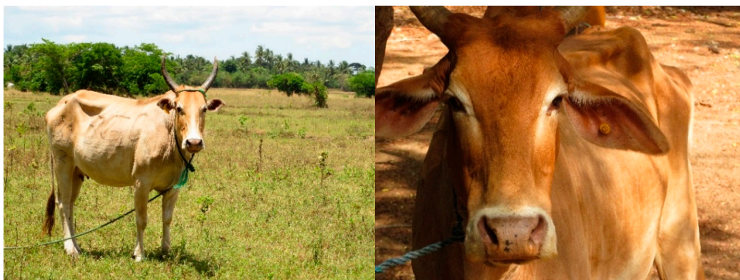
Figure 5. Farmers reported that efforts to introduce ear tags in the Eastern Province are impeded by poor tag retention in extensive systems.

The farmers believed ear tags were poorly designed for extensive operations; in addition to hindering identification from a distance, the farmers reported that ear tags were easily dislodged (Figure 5).