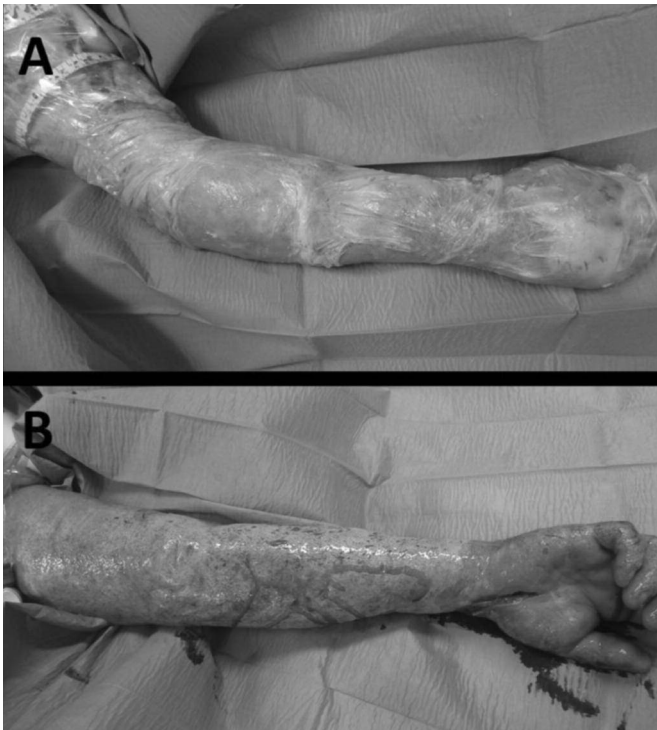
Fig. 1 - Enzymatic debridement of the upper extremities: A) during Nexobrid treatment; B) after Nexobrid treatment.

Thus, we decided to start an off-label enzymatic debridement at the bedside in the intensive care unit. Over the next few days, we performed a fractional use of enzymatic debridement with Nexobrid (Medi wound Ltd, Yavne, Israel) on 54% TBSA. On the fifth day, we performed an enzymatic debridement of the patient's upper limbs (20% TBSA, Fig. 1 ); this was performed again on the seventh day on the lower legs and feet