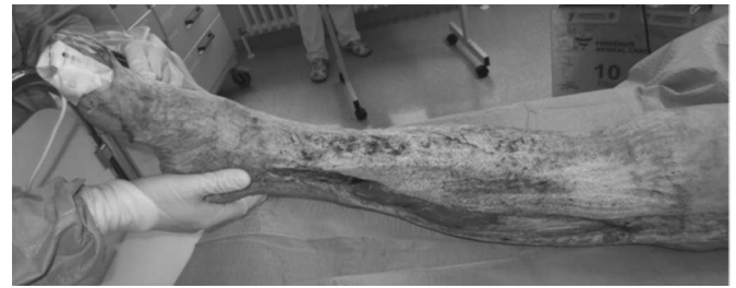
Fig. 2 - Enzymatic debridement of the lower legs and feet.

Thus, we decided to start an off-label enzymatic debridement at the bedside in the intensive care unit. Over the next few days, we performed a fractional use of enzymatic debridement with Nexobrid (Medi wound Ltd, Yavne, Israel) on 54% TBSA. On the fifth day, we performed an enzymatic debridement of the patient's upper limbs (20% TBSA, Fig. 1 ); this was performed again on the seventh day on the lower legs and feet