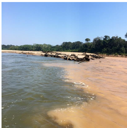
Figure 2. Photo looking upstream at the confluence of the relatively clear Tambopata River (left) and the more turbid Malinowski River (right), during the dry season sampling event in August 2017.

We noted that turbidity was significantly higher in the mainstem rivers ( 388 \pm 272 NTU) than their tributaries ( 71 \pm 77 NTU, p = 0.014 ) (Table 1). The single highest turbidity (890 NTU) was recorded at a mainstem site on Tambopata River during the wet season. The lowest turbidity (9 NTU) was recorded in a tributary to Malinowski River during the wet season. During the low-flow, dry season, the difference between the clear Tambopata ( 42 \pm 31 NTU) and turbid Malinowski ( 401 \pm 56 NTU) rivers was evident at their confluence (Figure 2). Despite the large difference in mean turbidity, only two sites measured in Malinowski River led to an adjusted p -value from Tukey's HSD of 0.069. For Heath River, turbidity in the mainstem was higher during the dry season ( 644 \pm 220 NTU) due to uncharacteristically large, daily precipitation events. However, in the wet season, Heath River had the lowest mean turbidity ( 305 \pm 187 NTU) in mainstem sites in comparison to both Tambopata ( 581 \pm 362 NTU) and Malinowski ( 359 \pm 168 NTU) rivers.