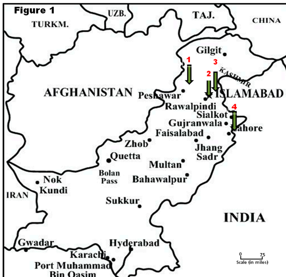
Figure 1. The study area where from the human volunteers (research participants) were recruited under the present investigation with type of areas in parenthesis: (1) Abbottabad (Rural); (2) Rawalpindi (Urban); (3) Islamabad (Urban); and (4) Lahore (Industrial).

AD, and 20 with both T2DM and AD. A routine questionnaire was administered to collect information about education, family history of T2DM, place of residence (urban vs. rural), and proximity of the residence to industrial pollution. For AD patients, family members helped to answer the questions. The analysis reported below was performed free of personal identifiers.