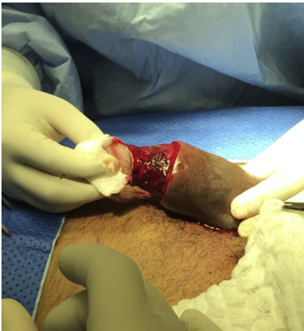
Fig. 1. First incision of pênis, with visualization of bruise in tunica albuginea.