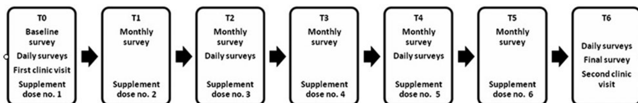
Fig. 1. Timeline of the study.

Depressive symptoms. The presence of depressive symptoms was assessed using the CES-D (44) . This depression scale consists of twenty items that are answered with reference to the last week on a Likert scale from zero ('rarely or none of the time', i.e. less than 1 d) to three ('most or all of the time', i.e. 5 to 7 d). Items include statements such as 'I thought my life had been a failure' and 'I had crying spells'. After reverse-scoring the four positively worded items, the scores for all items were summed to give a total score between 0 and 60 (Cronbach's \alpha = 0.882 ). A cut-off score of \geq 16 is recommended to indicate those who are at risk of depression. The CES-D was designed for use in community populations and focuses largely on the affective symptoms of depression. The CES-D is a validated instrument for the assessment of depressive symptoms and has been shown to be a reliable and valid tool for assessing the number, type and duration of depressive