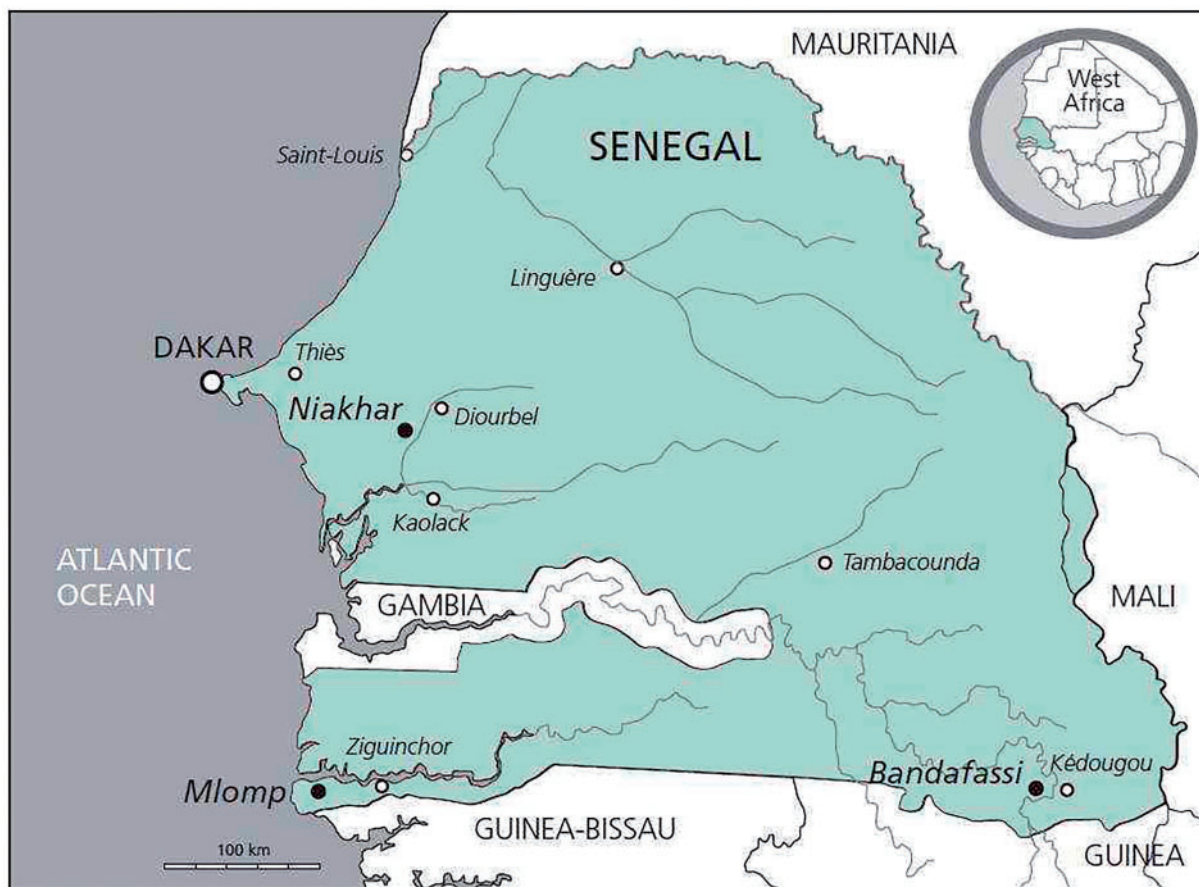
Figure 1. Location of Mlomp and the two other HDSS sites in Senegal.

The site is in a Guinea savannah and mangrove ecological zone. The area has a rainy season from June to October and a dry season from November to May, and had average annual rainfall of 1250 mm over the period 1985–2010.