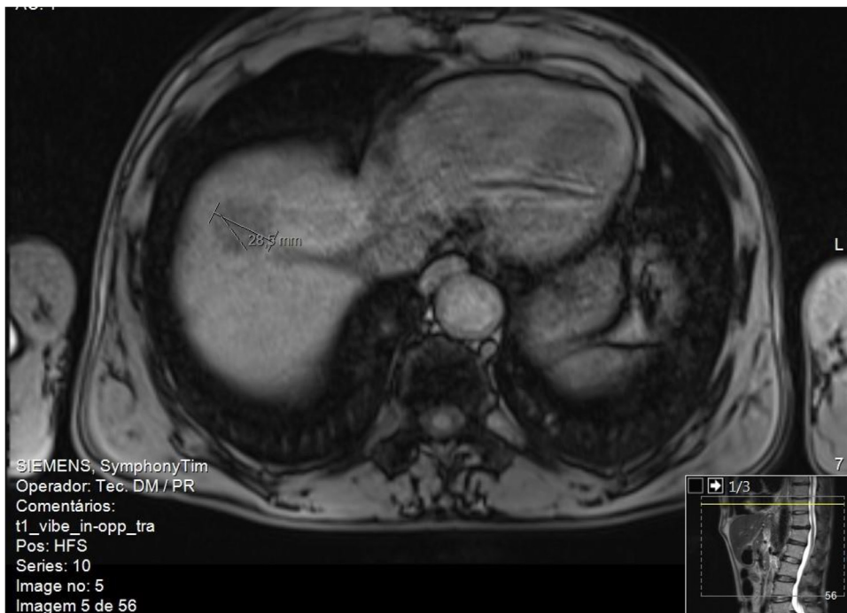
Fig. 2. Abdominal magnetic resonance cross-section. T1 weighted showing a nodular image with imaging features suggestive of suspected of hepatocellular carcinoma.

cutaneous porphyria resolution. About 13 months after the end of treatment, a 29 mm nodule on segments VII / VIII, suspected of hepatocellular carcinoma, was detected on magnetic resonance imaging (Fig. 2). The histological study was compatible with well differentiated hepatocellular carcinoma, with extensive areas of necrosis, rare images suggestive of intratumoral lymphovascular invasion and absence of evidence of extratumoral lymphovascular invasion; the minimum surgical margin was 5 mm (pT2NxR0).