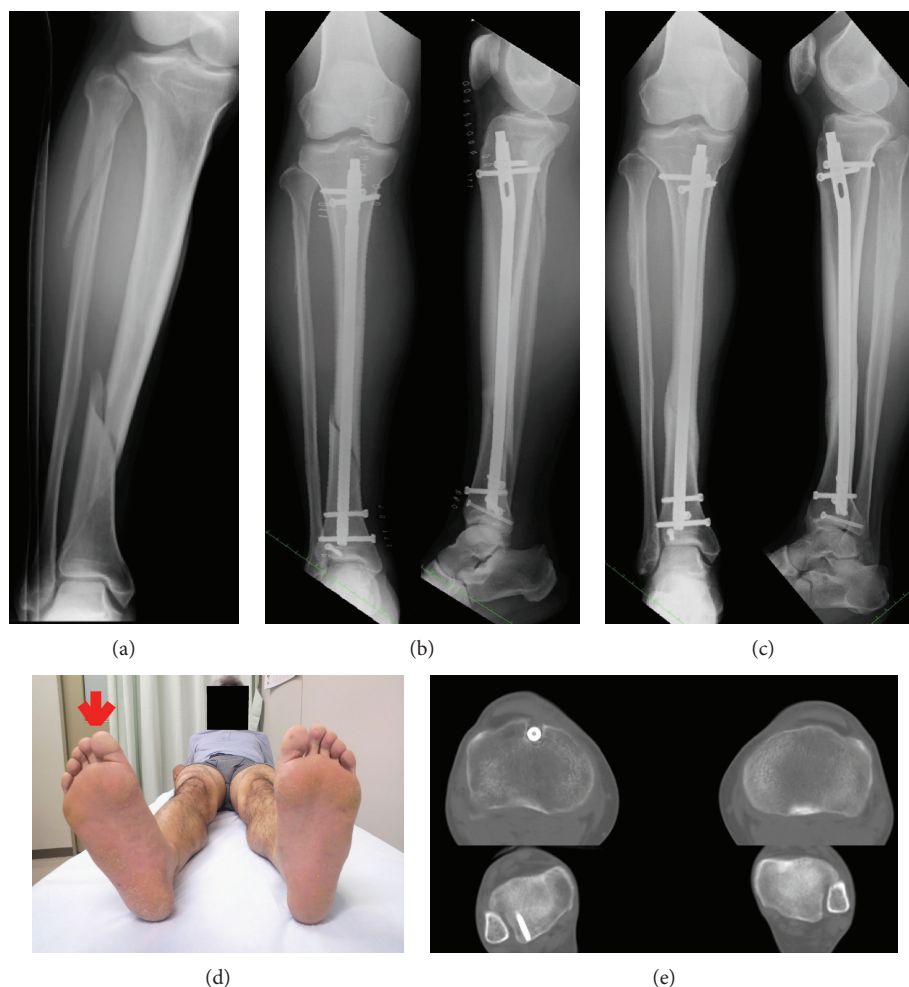
FIGURE 1: (a) Initial posttraumatic anteroposterior radiographs of the right tibia and fibula. (b-c) Anteroposterior and lateral radiographs of the right tibia obtained (b) immediate postoperatively and (c) 1 year postoperatively. (d) Photograph. (e) Computed tomography (CT) images of the right and left tibia of the patient show external tibial torsion.

his legs, difficulty walking and running, and inability to ride a bicycle. Computed tomography (CT) of both tibiae showed 24^\circ of increased external rotation of the affected leg (Figures 1(d), 1(e)). Because it was a symptomatic rotational deformity, we decided to perform corrective osteotomy in a minimally invasive fashion.