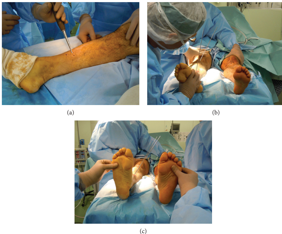
FIGURE 2: Photographs. (a) Small incision at the original fracture site. (b) Two 3.0 mm Kirschner wires were inserted as guides for correction. (c) Kirschner wires used as a guide for correcting the angle between the proximal and distal bones, which are matched in a straight line.