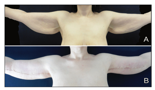
Figure 4: (A) Anterior views of a 29-year-old woman who underwent liposuction-assisted brachioplasty after sleeve gastrectomy and weight loss of 59 kg. (B) Six months postoperatively. Note the location and the quality of the scar

lower in the LAB group (9% vs. 60%, P < 0.01). In the LAB group, only one patient (smoker) had problems of wound healing after surgery; in the control group, seven patients (35%) had seroma and five patients (25%) had wound separation. The incidence of hypertrophic scarring or keloid was higher in the second group (55% vs. 18%). Five patients (20%) of the control group experienced a recurrence of skin ptosis, whereas none of the LAB group had such problems.