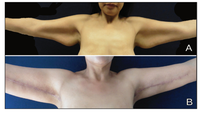
Figure 3: (A) Anterior view of a 38-year-old woman who underwent liposuction-assisted brachioplasty after gastric bypass and weight loss of 54 kg. (B) Six months postoperatively. Skin excess had been removed and the arm contour was aesthetically pleasing

Major postoperative complications such as re-treatment, bleeding, or thrombo-embolism were not observed in the two groups. The incidence of minor complications (wound separation, wound infection, and seroma) was globally 42%; the incidence of complications was significantly