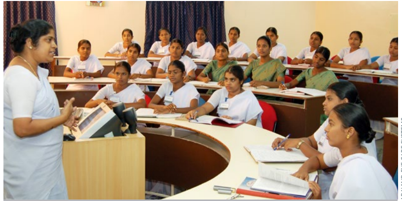
Mid-level Ophthalmic Personnel Training at Aravind Eye Care Systems, Chennai. INDIA

Human resources in the right numbers, mix and distribution are key to ensuring universal eye health. It is imperative to get a good sense of the current status and challenges in the different countries in South Asia.