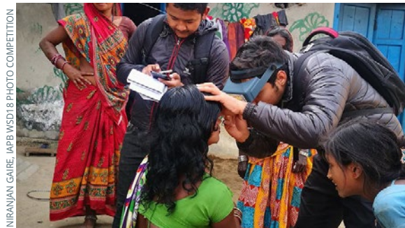
A trachoma elimination survey in Nepal. NEPAL

The solutions to addressing this inadequacy in human resources in the countries of the region are diverse. Adoption of strategies like competency based assessments (CBA) and skill certification are emerging as innovative ways to fast-track the development of allied ophthalmic personnel and ensure that they are competent and reliable. Multiple creative—and successful—approaches are being deployed to bring and retain AOP in rural settings across the region. This issue presents a number of these examples from the region. In conclusion we need every effort and innovation to develop and retain skilled human resources, so that we can ensure that eye health reaches everyone, everywhere.