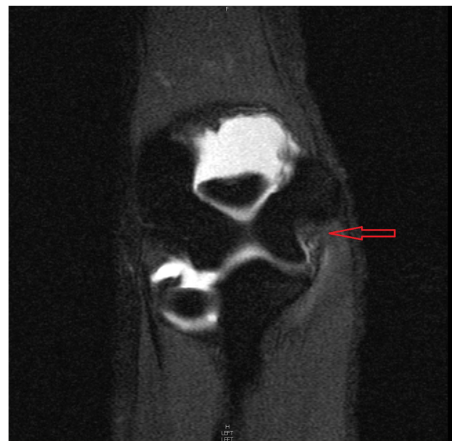
Figure 4 Left elbow MRI with contrast demonstrating high-grade proximal tear of the UCL. (T1 fat-suppressed 1.5T coronal image).

The prevalence of UCL injuries in gymnasts is not known. There are three retrospective studies in the literature that