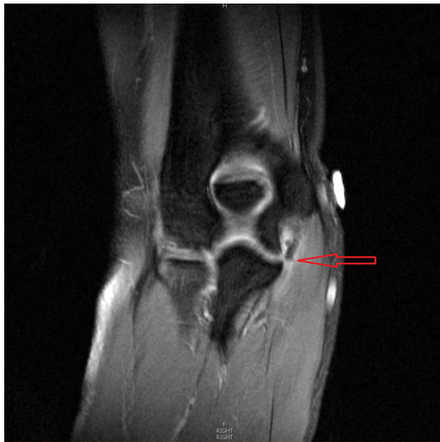
Figure 5 Right elbow MRI with contrast showing complete tear of the UCL distally. (T1 fat saturated 1.5T coronal image).

Note: Arrow points to the exact site of UCL injury.