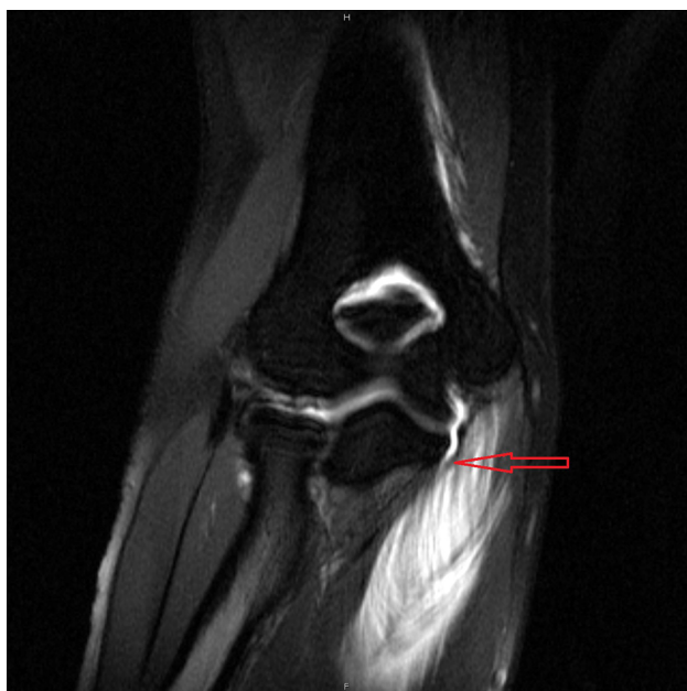
Figure 1 Right elbow MRI with contrast showing distal UCL injury and extravasation of contrast (T1/fat suppressed 1.5T coronal image).

A 19-year-old female with a history of elbow pain presented for evaluation after feeling a “pop” in her right elbow while