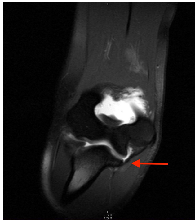
Figure 2 Right elbow MRI with contrast showing partial tear of UCL distally with old proximal UCL injury suspected (T1/fat suppressed 1.5T coronal image).

Abbreviation: UCL, ulnar collateral ligament.